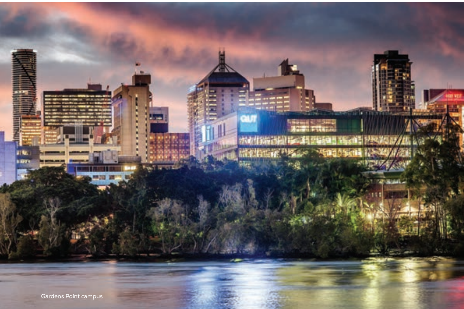
Gardens Point campus