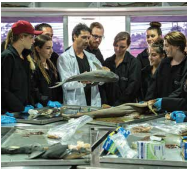
The BIOMOL lab specializes in the conservation of species such as sharks, rays, sea turtles and invertebrates.